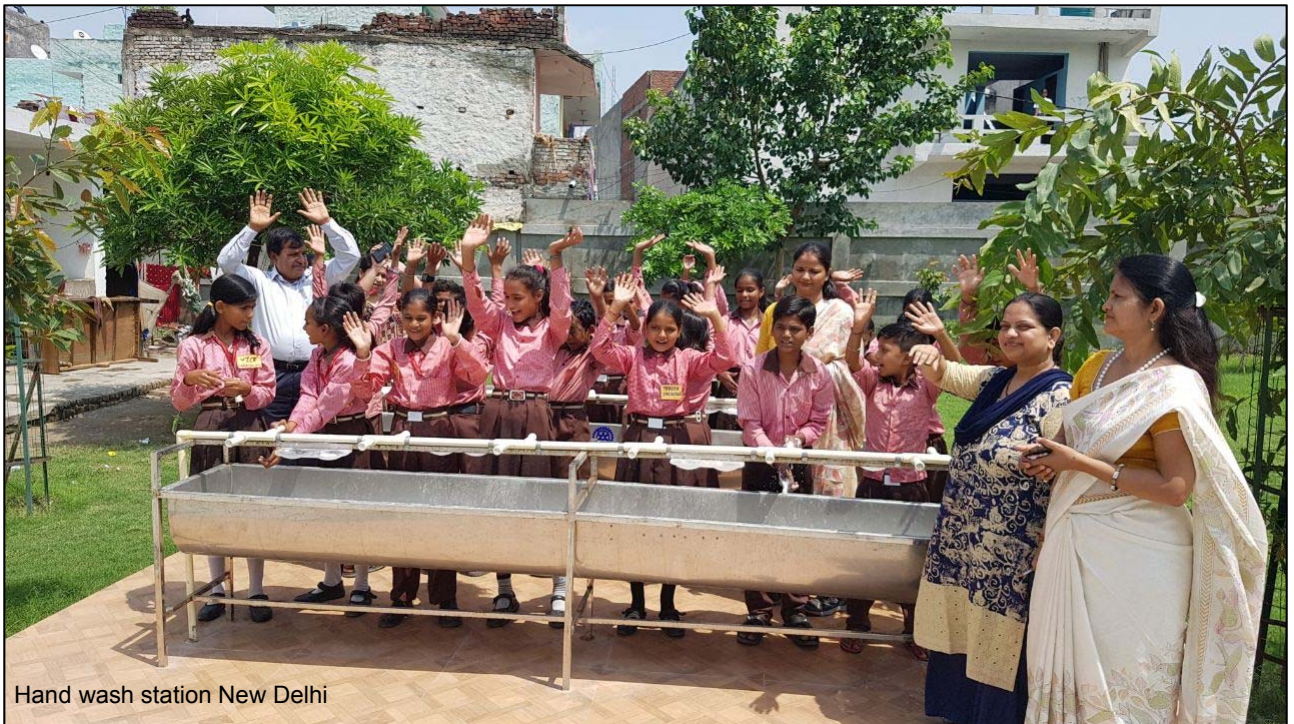
Hand wash station New Delhi