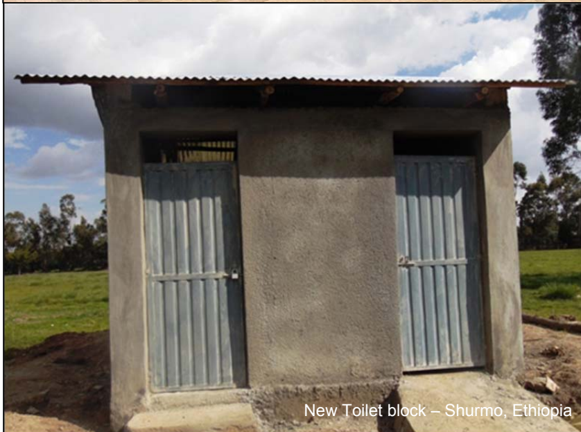
New Toilet block – Shurmo, Ethiopia