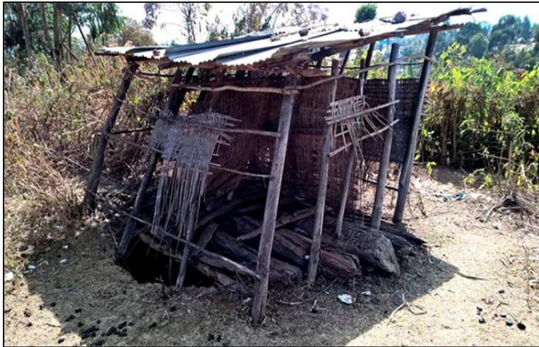
Figure 1. Example of latrines at a school in the Shurmo area

issues are: females (both students and teachers) will not attend school during their menstruation, students with disabilities cannot safely use the facilities, students and teachers will leave the school grounds to return home (sometimes not returning) and poor levels of sanitation.