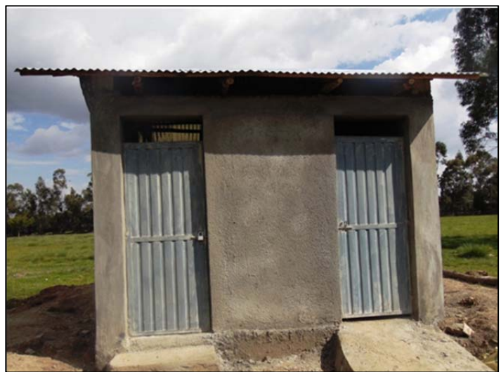
Figure 3. Shurmo Witbira VIP Latrine

The project was successfully carried out between September 2016 and June 2017.