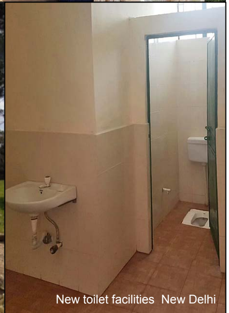
New toilet facilities New Delhi