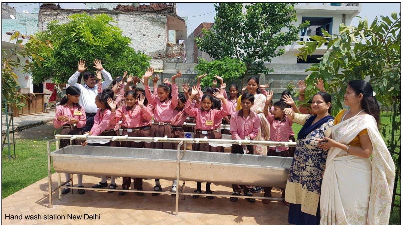
Hand wash station New Delhi