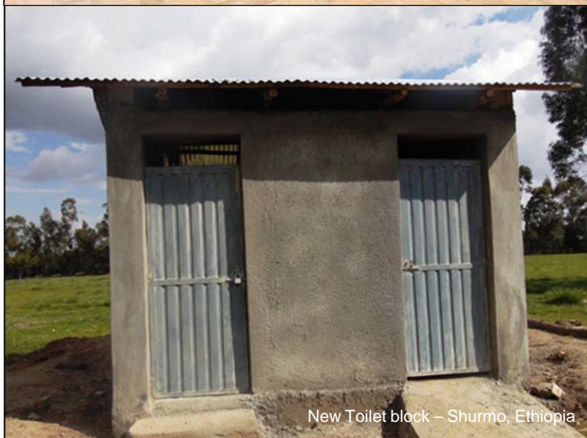
New Toilet block – Shurmo, Ethiopia